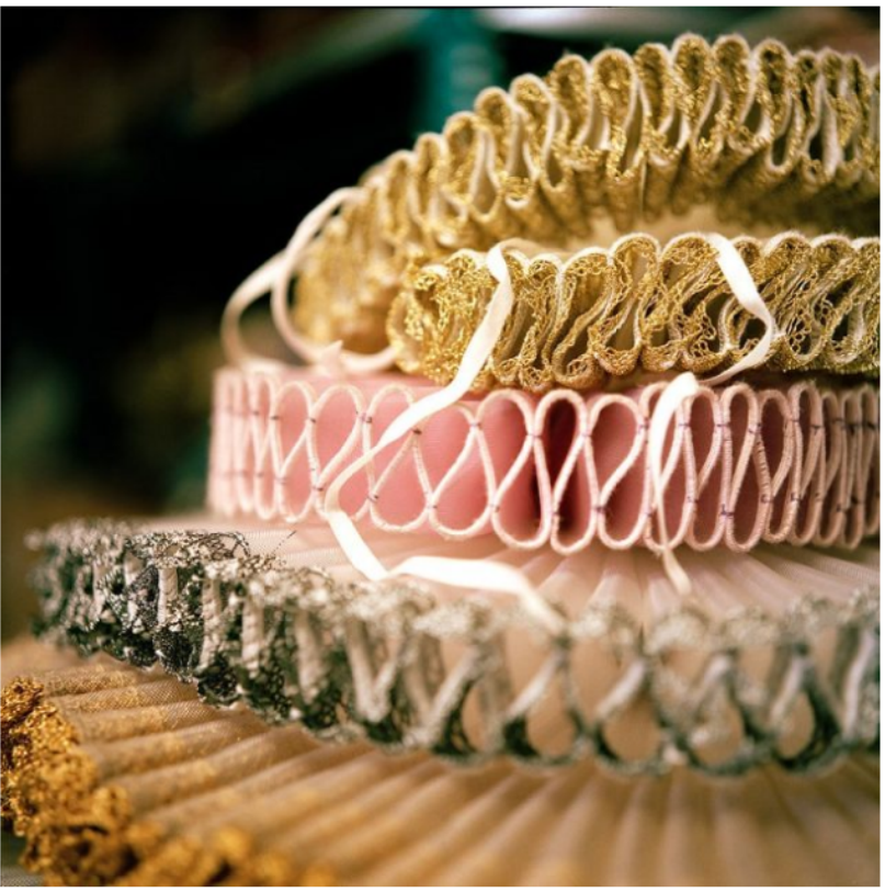
Nicolao Atelier Sartoria Teatrale, Venice