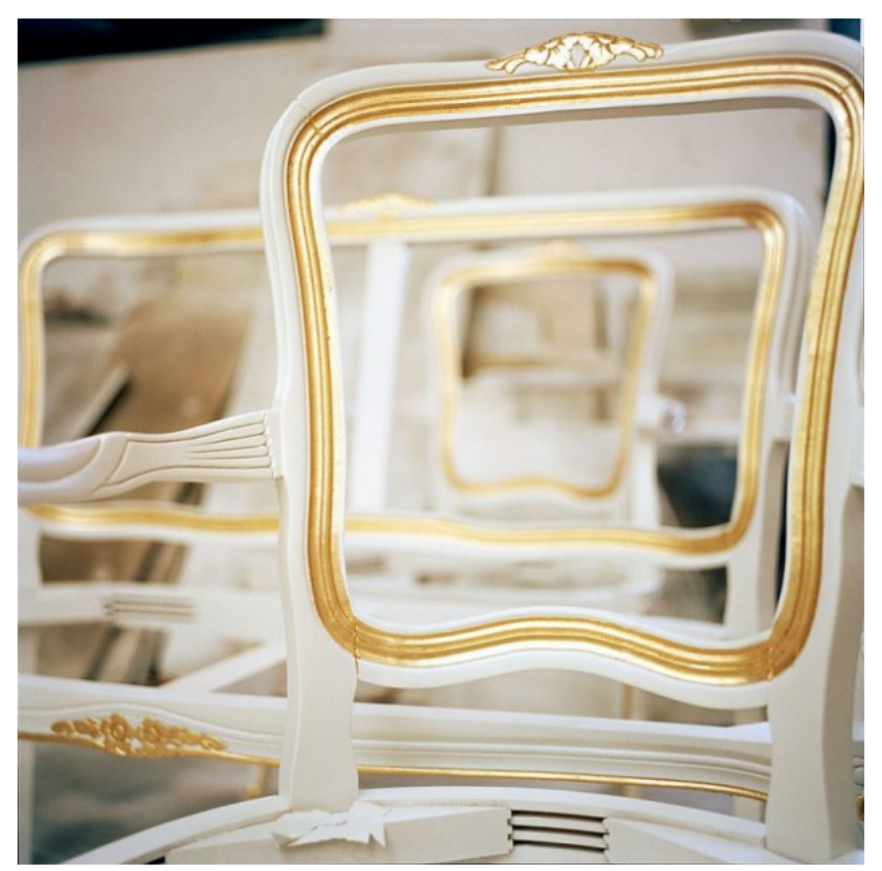
Morelato, Salissole Verona