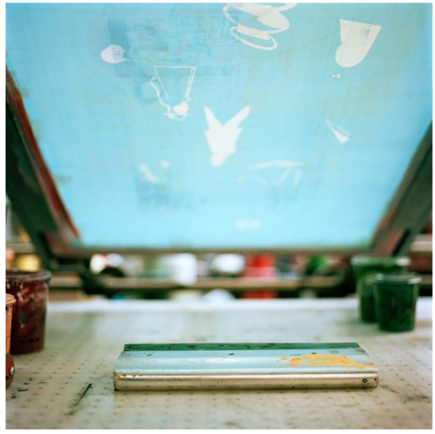
Fallani Venezia, Venice