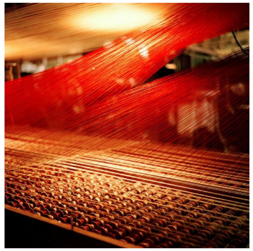
Tessitura Luigi Bevilacqua, Venice