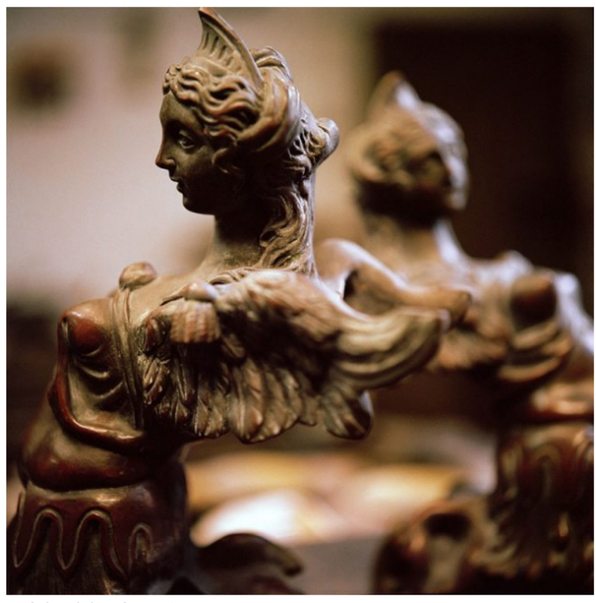
Fonderia Artistica Valese, Venice