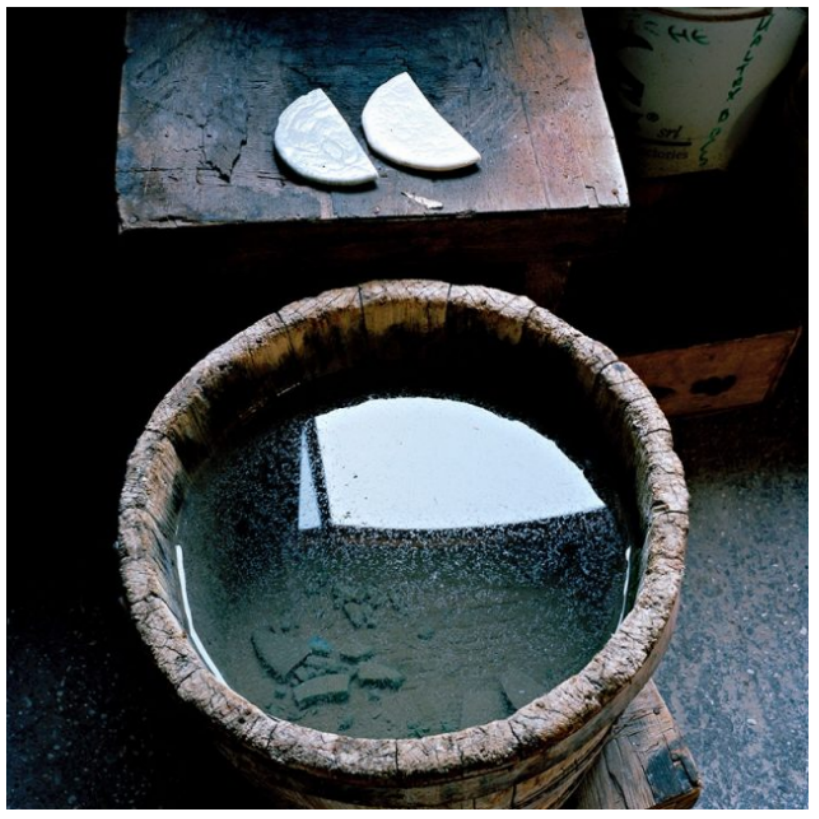
Fornace Orsoni, Venice