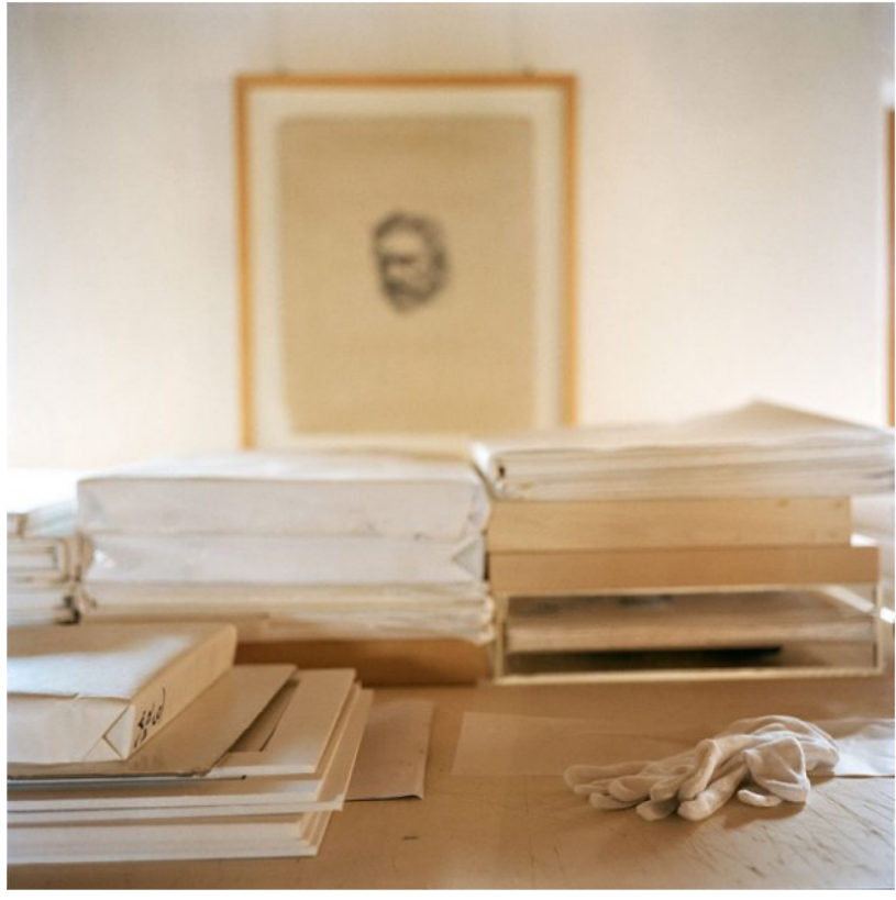
Ceramiche Artistiche 3B, Nove, Vicenza