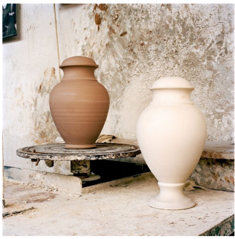
Ceramiche Artistiche 3B, Nove, Vicenza