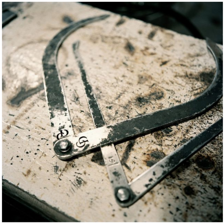
Vetreria Anfora, Venice