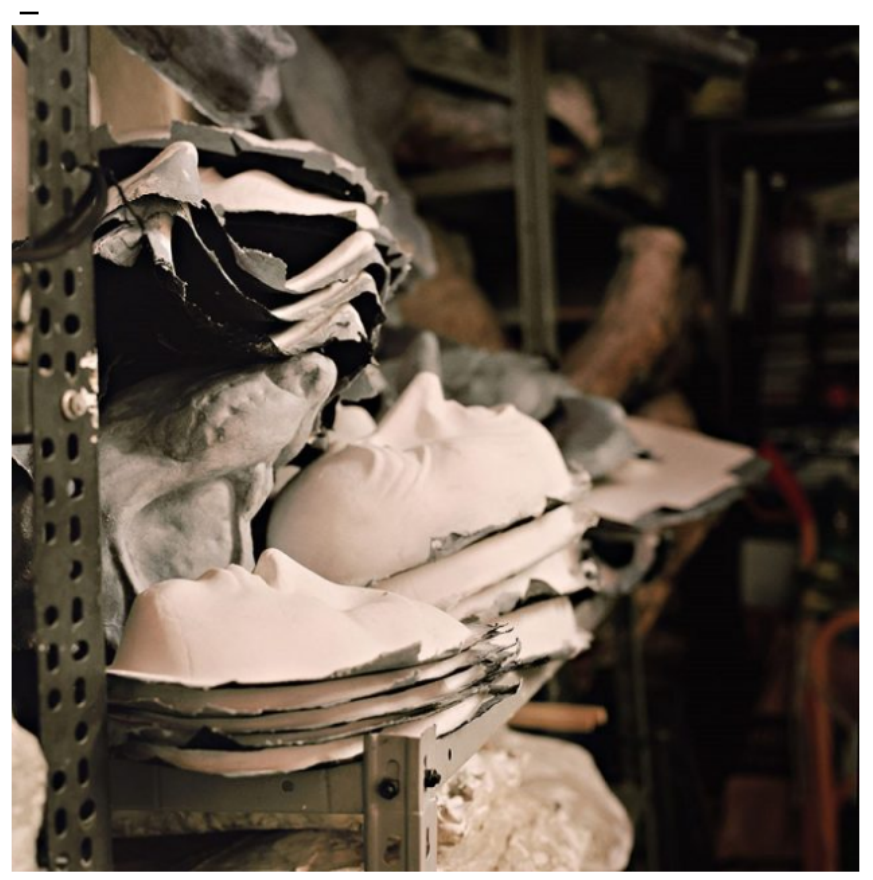
Bottega dei Mascareri, Venice