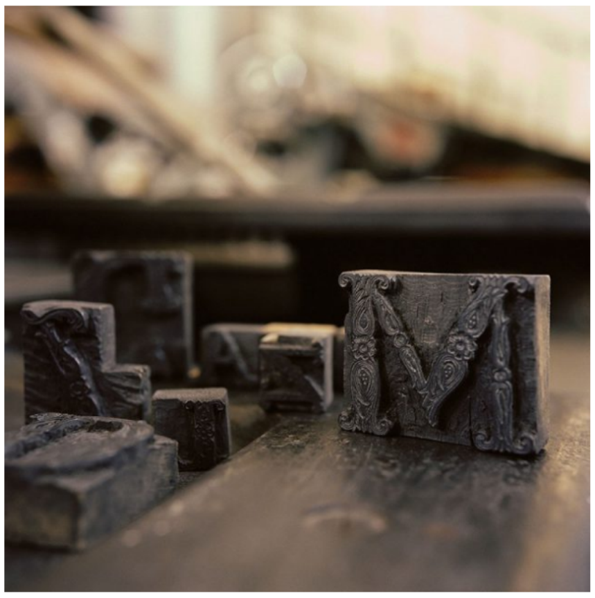
Tipoteca Italiana, Cornuda, Treviso