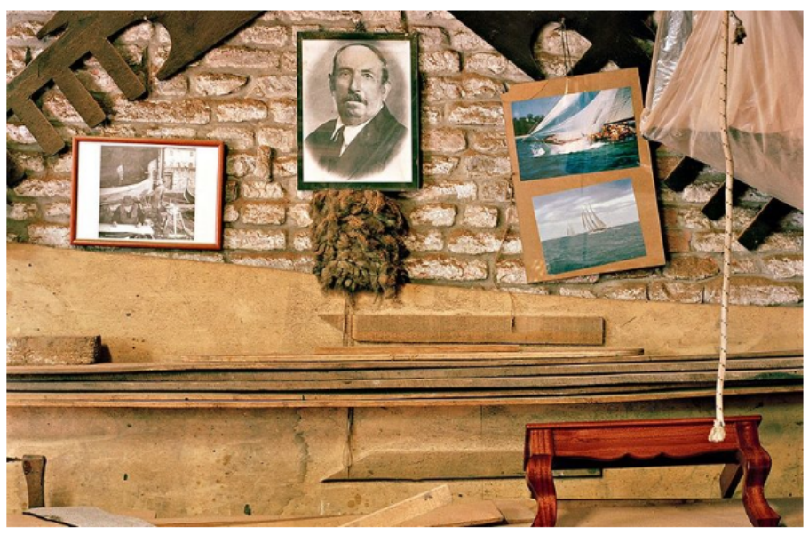
Domenico Tramontin & Figli, Venice